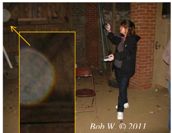
Rob W. © 2011

To see more photos from this investigation go to Christine's Facebook page: www.facebook.com/people/Christine-B-Morris/1451195089 . Go to Photos then to Prospect Place.