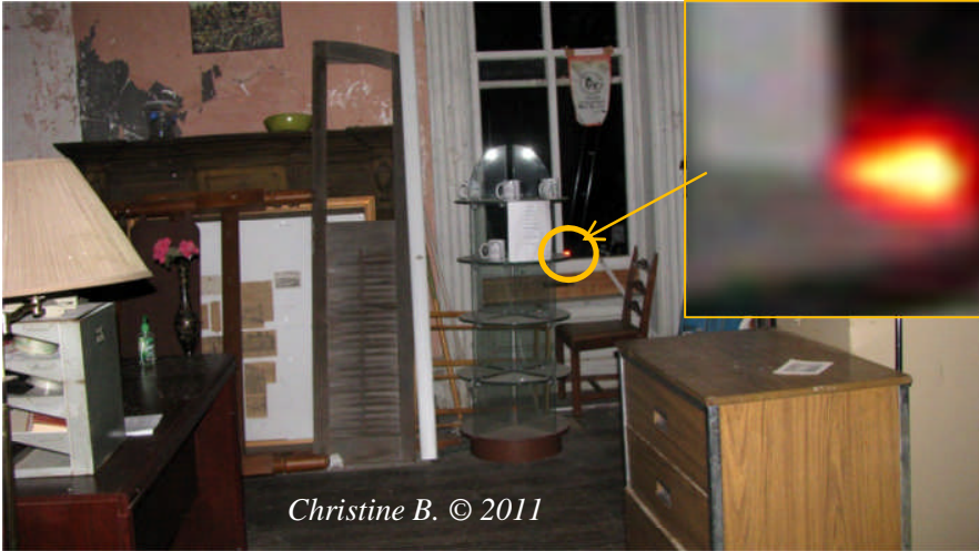
Christine B. © 2011

Left: This photo was taken in the "Gift Shop" It faces the back yard and woods... once again, not sure what it is, but it is interesting.