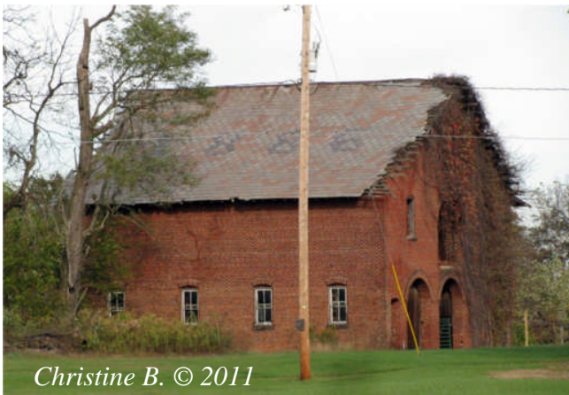
Christine B. © 2011

that we ever had before at any other haunted location we have investigated. Our KII, Mel and Gauss meters were relatively quiet considering the amount of activity we felt and photographed. The brick horse barn is a hot spot on the property, probably due to the fact that a slave bounty hunter who came to the house looking for escaped slaves was hung from the second floor there in the mid 1800s. The photo below shows where he was hung.