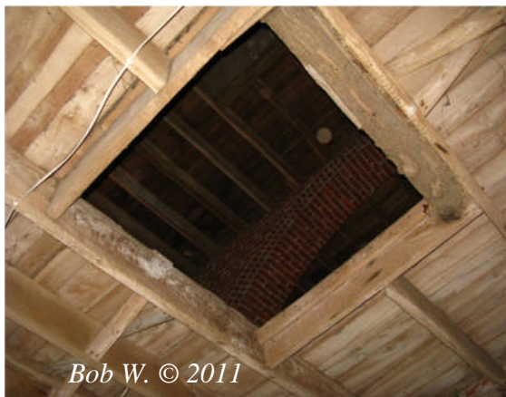
Bob W. © 2011

that we ever had before at any other haunted location we have investigated. Our KII, Mel and Gauss meters were relatively quiet considering the amount of activity we felt and photographed. The brick horse barn is a hot spot on the property, probably due to the fact that a slave bounty hunter who came to the house looking for escaped slaves was hung from the second floor there in the mid 1800s. The photo below shows where he was hung.