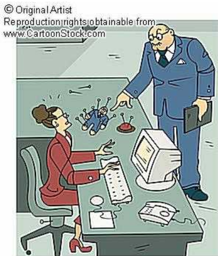
© Original Artist Reproduction rights obtainable from www.CartoonStock.com

Today, a significant percent of the population of New Orleans partake in Voodoo rituals. The practice of Voodoo involves the blessing of a Voodoo doll by an experienced practitioner which allows the possessor of the doll to contact the spirits directly - requesting fulfillment in love, finance, career, family matters, etc.