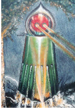
The Flatwoods Monster

Virginia that has huge wings, glowing eyes, no head. Other winged humanoids have been seen in places like Vietnam and the British Isles.