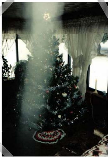
Photograph of a possible Vortex