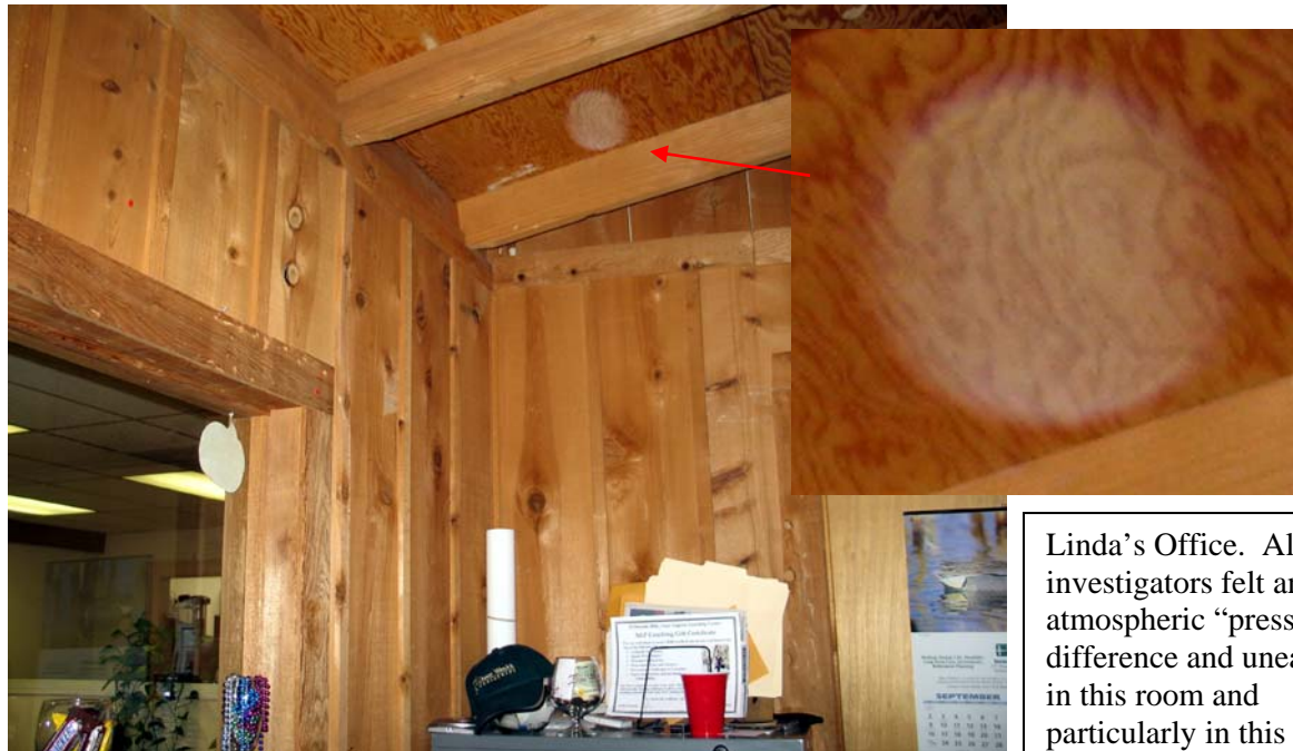
Linda's Office. All investigators felt an atmospheric "pressure" difference and uneasiness in this room and particularly in this corner