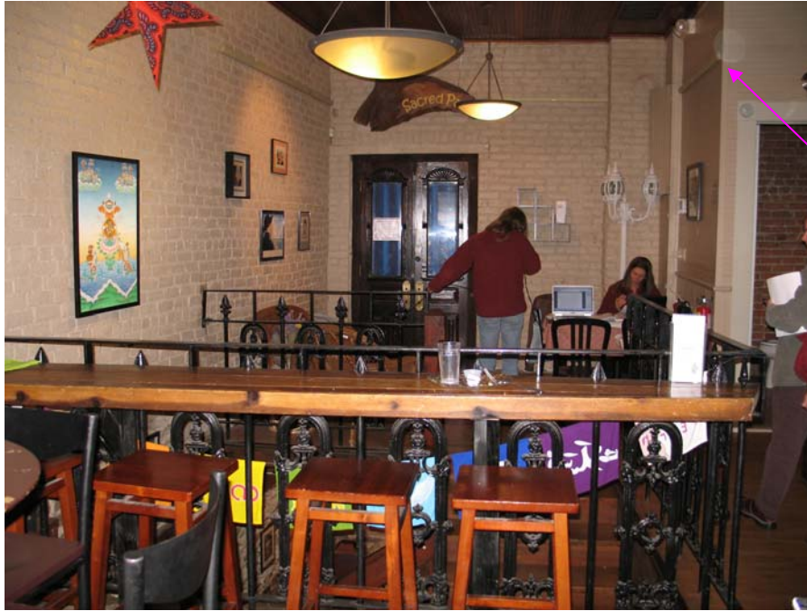
Second orb shot in upstairs of Cozmic Café.