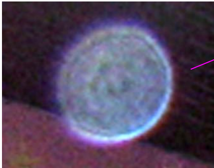
Third orb captured in photograph in the front section of the Café.