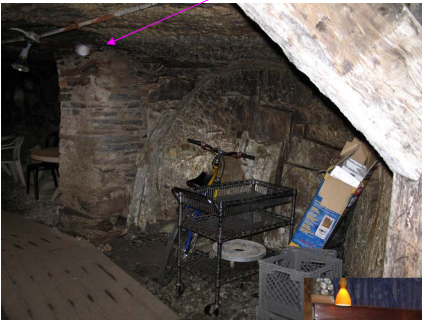
This is a section of the tunnel in the building that a few of the investigators thought had a strange atmosphere and/or felt colder than the other areas of the tunnel. The orb was not visible when the photograph was taken.